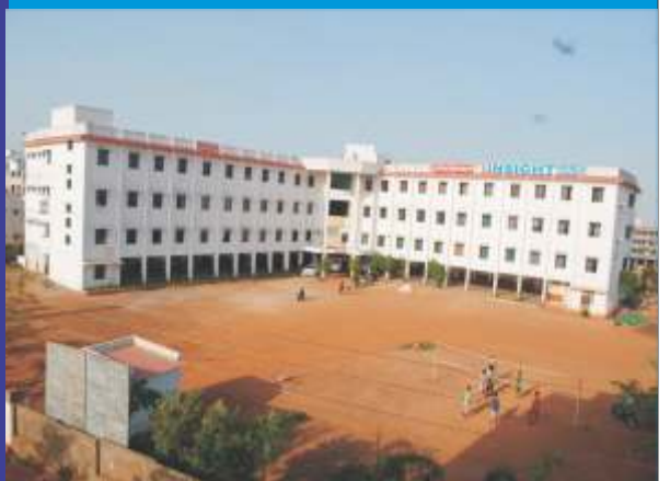
Indira College of Science & Management Chandrapur