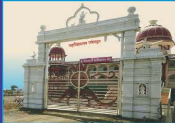
Dr. R.G. Bhoyar Arts, Commerce and Science College, Seloo