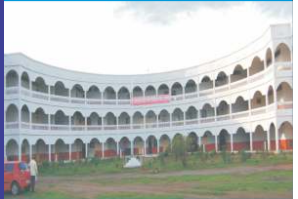
Arts & Science College, Pulgaon